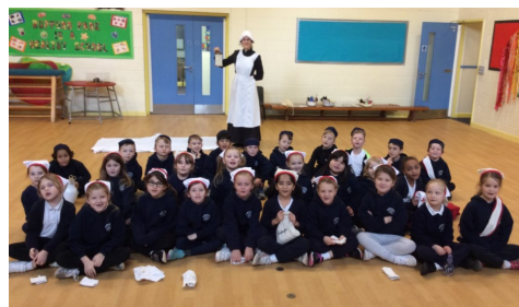
Y2 Cherry Tree Class learning all about Florence Nightingale

Please click on the link below to find out what your child has been doing in class this week.