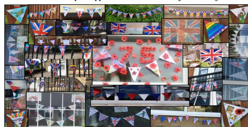
1945 - 2020: 75 Years

Friends of Rufford Park - VE Day Bunting