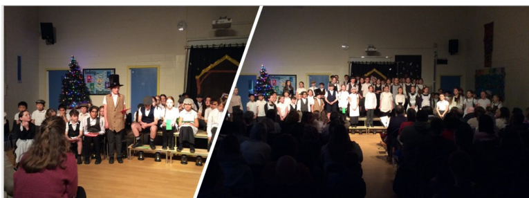
UKS2 (left) delivered a brilliant Christmas assembly to parents on Tuesday.

I hope you have a lovely Christmas and a peaceful New Year!