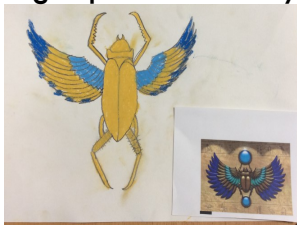
Scarab Beetle - Mason R