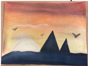
Egyptian Sunset - Isla L